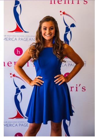
Interview - 40%