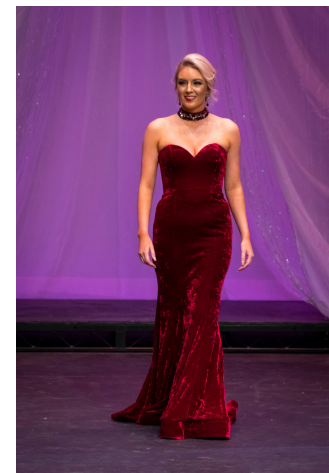
Evening Gown - 40%

*Jr. High must wear a ballgown or full skirt and no slits are allowed. High school may have a slit at the knee or below